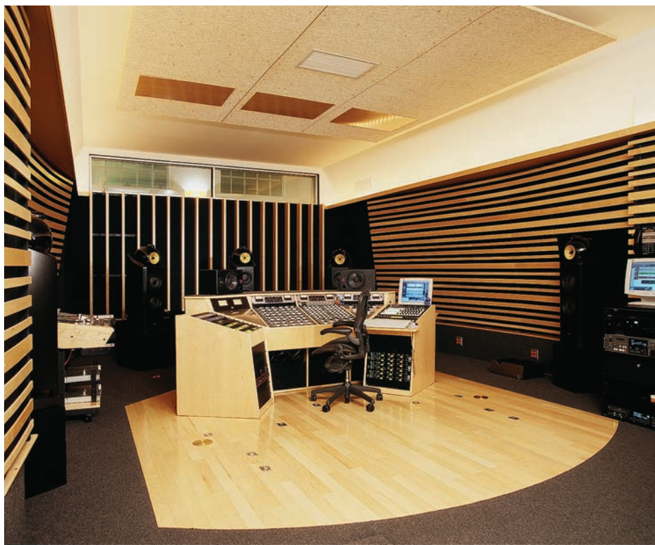
Fig. 2. Marcussen Mastering, Hollywood, California.

spatial relationships between the loudspeakers, the sloping ceiling, the console, and the outboard equipment cabinet. The studio window affords full visibility between the loudspeakers, but the glass dips down and extends under the loudspeakers as well. The rear ceiling and the undersides of the soffits are fully trapped.