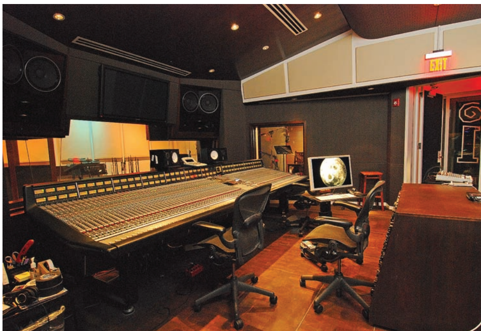
Fig. 1. Interscope Records control room, showing flush-mounted loudspeakers, sloping ceiling, and side soffits.

hears both speakers (interaural crosstalk), a phantom center image is not the same as that heard on headphones. The direct path length from either loudspeaker to one ear is different from that to the other, producing a comb filter with its first dip around 2 kHz. In contrast, a good ensemble of symmetrical lateral reflections spreads out the sweet spot, adds depth to the stereo image, and helps fill in the 2 kHz dip.